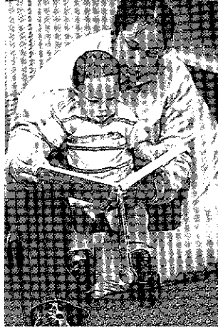
Multnomah CourtCare offers nurturing care to kids whose parents need to be in court.

Multnomah CourtCare opened its doors in December 2001 as a program of the Volunteers of America Oregon, in partnership with the Multnomah Bar Association, Multnomah County and the State of Oregon. The program has provided care to over 4,400 children, improved access to justice for their families, and smoothed courthouse operations. Multnomah CourtCare is Oregon's only full-time drop-in childcare program in a court building.