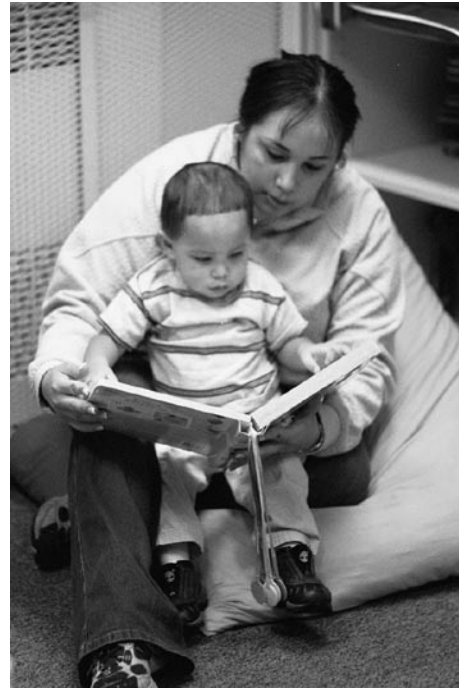
A CourtCare aide reads to one of the children in the program

Convinced of the need to address this situation, the MBA formed a new Multnomah CourtCare Advisory Board the following year and charged it with